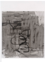
Christopher Wool Untitled (P571) , 2008 Enamel on linen 106 X 96 inches (269.24 X 243.84 cm) C16271