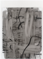
Christopher Wool Untitled (P548) , 2007 Enamel on linen 126 X 96 inches (320.04 X 243.84 cm) C14023