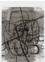
Christopher Wool Untitled (P573) , 2008 Enamel on linen 126 X 96 inches (320.04 X 243.84 cm) C16273