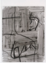
Christopher Wool Untitled (P564) , 2007 Enamel on linen 126 X 96 inches (320.04 X 243.84 cm) C16246