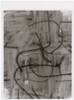
Christopher Wool Untitled (P565) , 2007 Enamel on linen 126 X 96 inches (320.04 X 243.84 cm) C16247