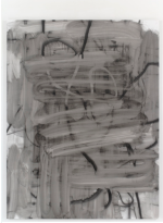
Christopher Wool Untitled (P544) , 2007 Enamel on linen 126 X 96 inches (320.04 X 243.84 cm) C13794