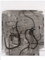
Christopher Wool Untitled (P572) , 2008 Enamel on linen 106 X 96 inches (269.24 X 243.84 cm) C16272