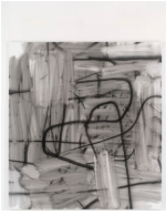
Christopher Wool Untitled (P561) , 2007 Enamel on linen 106 X 96 inches (269.24 X 243.84 cm) C16245