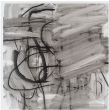
Christopher Wool Untitled (P557) , 2007 Enamel on linen 108 X 108 inches (274.32 X 274.32 cm) C15469