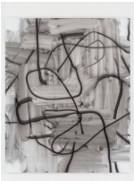
Christopher Wool Untitled (P551) , 2007 Enamel on linen 126 X 96 inches (320.04 X 243.84 cm) C15883