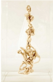
Mira Schendel Untitled from the series Droguinhas (little nothings) , 1965-1966 Rice paper Dimensions variable C25880

531 West 24th Street New York NY 10011 tel 212 206 9100 fax 212 206 9055 www.luhringaugustine.com