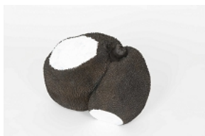
Erika Verzutti Brasilia Teatro (Brasilia Theater) , 2014 Bronze and acrylic Edition of 3 19 5/8 x 15 11/16 x 11 3/8 inches (50 x 40 x 29 cm) P25919