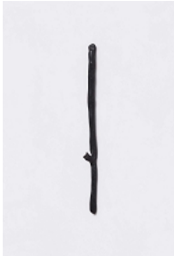
Paulo Monteiro Untitled, 2011 Bronze Unique From a series of 3 15 15/16 x 1 11/16 x 1 3/8 inches (40.5 x 1.8 x 3.6 cm) C25908

531 West 24th Street New York NY 10011 tel 212 206 9100 fax 212 206 9055 www.luhringaugustine.com