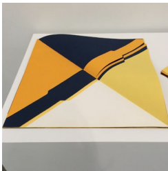
Raymundo Colares Gibi , 1980 Cut paper 17 11/16 x 17 11/16 inches (45 x 45 cm) C25883