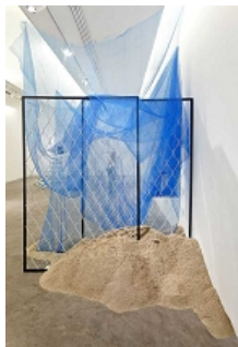
Rodrigo Matheus Em obras , 2014 Iron fence, sand, and screen 157 7/16 x 110 3/16 x 106 1/4 inches (400 x 280 x 270 cm) C25897