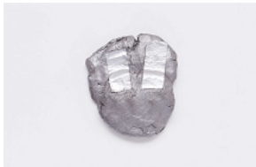
Paulo Monteiro Untitled, 2011 Aluminum and aluminum tape Edition 3 of 5 5 1/16 x 4 5/16 x 3/4 inches (13 x 11 x 2 cm) C25900