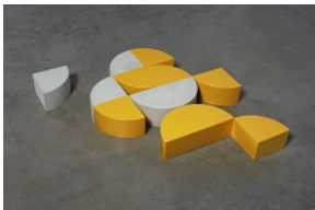
Marcus Galan Untitled, 2015 Painted concrete From the series Common Area 5 1/16 x 39 5/16 x 39 5/16 inches (13 x 100 x 100 cm) C25891