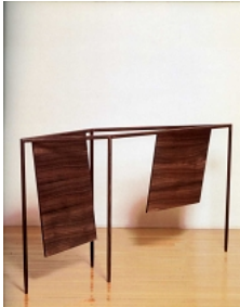
Waltercio Caldas Wood wind , 1994 Wood Edition 2 of 3 27 1/8 x 50 3/8 x 11 3/4 inches (69 x 128 x 30 cm) ZL12880

531 West 24th Street New York NY 10011 tel 212 206 9100 fax 212 206 9055 www.luhringaugustine.com