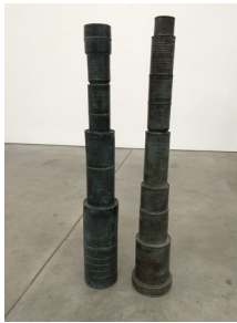
Antonio Dias Duas Torres , 2002 Patinated bronze 2 elements 35 x 5 7/8 inches (89 x 15 cm) C25886