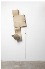
Tunga Albino , 1982 Cotton felt, cotton rope, and hardware Unique 98 3/8 x 66 7/8 x 3 7/8 inches (250 x 170 x 10 cm) C25895