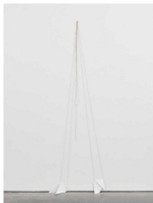
Marcius Galan Bandeirinha (Bunting) , 2013 Painted iron and string Dimensions variable C26035