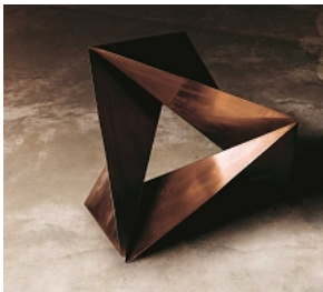
Amilcar de Castro Estrela , 1952 Copper 17 11/16 x 17 11/16 x 17 11/16 inches (45 x 45 x 45 cm) C25873