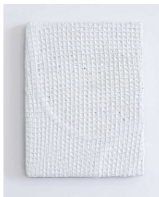
Alexandre Da Cunha Net III , 2014 Vest, acrylic, canvas 16 1/8 x 12 3/16 x 1 9/16 inches (41 x 31 x 4 cm) C29065