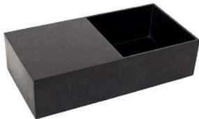
Antonio Dias Hands , 1975/2002 Painted steel Edition 8 of 8 3 7/8 x 7 13/16 x 15 11/16 inches (10 x 20 x 40 cm) C25892