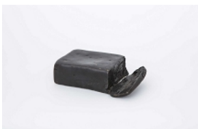
Paulo Monteiro Bananada , 2011 Bronze 1 3/8 x 6 1/4 x 2 3/4 inches (3.5 x 16 x 7 cm) C25898