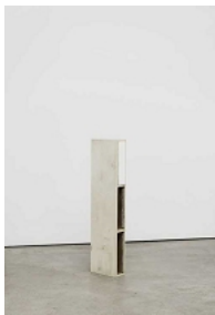
Fernanda Gomes Untitled, 2008 Wood 42 7/8 x 14 1/8 x 4 5/16 inches (109 x 36 x 11 cm) C25887