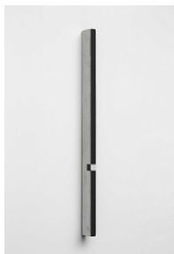
Willys de Castro Untitled - Objeto Ativo , 1959 Oil on canvas on wood 20 3/8 x 5/8 x 1 1/2 inches (51.8 x 1.6 x 3.9 cm) C29066