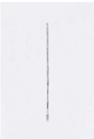
Paulo Monteiro Untitled, 2012 Aluminum 25 15/16 x 5/8 x 1 1/4 inches (66 x 1.6 x 3.2 cm) C25905