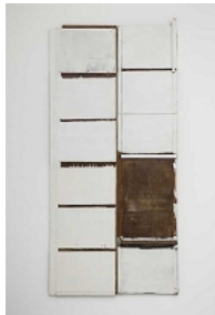
Fernanda Gomes Untitled, 2011 Wood and paint 76 3/8 x 35 3/8 x 1 3/4 inches (194 x 90 x 4.5 cm) C25889