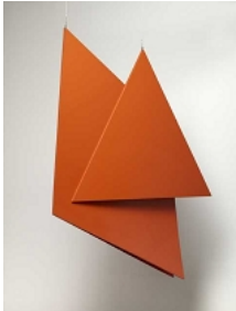
Helio Oiticica Relevo Espacial 6 , 1959, constructed: 1991 Painted wood 38 11/16 x 30 11/16 x 4 inches (98.4 x 78.1 x 10.2 cm) C25877

531 West 24th Street New York NY 10011 tel 212 206 9100 fax 212 206 9055 www.luhringaugustine.com