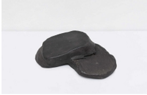
Paulo Monteiro Untitled, 2012 Lead Edition 1 of 3 2 7/16 x 7 15/16 x 8 1/16 inches (6.3 x 20.3 x 20.5 cm) C25909

531 West 24th Street New York NY 10011 tel 212 206 9100 fax 212 206 9055 www.luhringaugustine.com