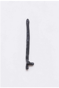
Paulo Monteiro Untitled, 2011 Bronze Edition 1 of 3 11 3/16 x 1 11/16 x 1 9/16 inches (28.5 x 4.4 x 4 cm) C25902