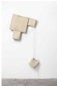
Tunga Albino , 1982 Cotton felt, cotton rope, and hardware Unique 98 3/8 x 66 7/8 x 3 7/8 inches (250 x 170 x 10 cm) C25894