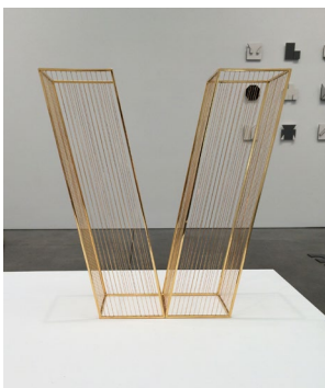
Lygia Pape Ttéia Metalica , 2003 Bronze plated gold Each tower: 19 5/8 x 5 1/2 x 5 1/2 inches (50 x 14 x 14 cm) C25878