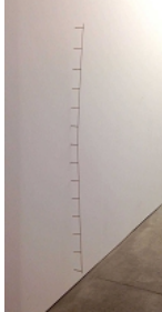
Fernanda Gomes Untitled, 2015 Iron 78 11/16 x 5 7/8 x 5/16 inches (200 x 15 x 0.8 cm) C25890

531 West 24th Street New York NY 10011 tel 212 206 9100 fax 212 206 9055 www.luhringaugustine.com