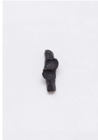
Paulo Monteiro Untitled, 2013 Bronze Edition 1 of 3 3 3/8 x 1 3/8 x 1 1/16 inches (8.6 x 3.5 x 2.8 cm) C25901

531 West 24th Street New York NY 10011 tel 212 206 9100 fax 212 206 9055 www.luhringaugustine.com