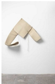
Tunga Albino , 1982 Cotton felt, cotton rope, and hardware Unique 66 7/8 x 98 3/8 x 3 7/8 inches (170 x 250 x 10 cm) C25893