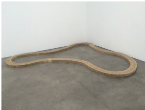
Jac Leirner Todos os cem (All the One Hundreds) , 1992 Brazilian currencies 3 1/8 x 472 1/4 x 6 1/4 inches (7.9 x 1199.5 x 15.9 cm) C6677 Collection of the Phoenix Art Museum, Gift of Diane and Bruce Halle