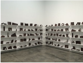
Amilcar de Castro Untitled, circa 1990 140 sculptures of Corten steel Edition 3 of 3 Dimensions variable C25874

531 West 24th Street New York NY 10011 tel 212 206 9100 fax 212 206 9055 www.luhringaugustine.com