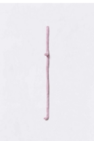
Paulo Monteiro Untitled, 2011 Oil on epoxy 20 13/16 x 1 1/8 x 1 9/16 inches (53 x 3 x 4 cm) C25904