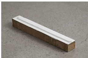
Fernanda Gomes Untitled, 2011 Wood and paint 2 5/16 x 19 5/8 x 2 3/4 inches (6 x 50 x 7 cm) C25888