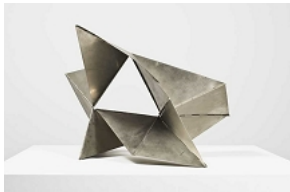
Lygia Clark Bicho , 1960/1984 Steel 19 5/8 x 17 11/16 inches (50 x 45 cm) C25876