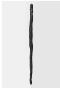
Paulo Monteiro Untitled, 2000 Lead 45 1/4 x 2 5/16 x 1 3/4 inches (115 x 6 x 4.5 cm) C25903