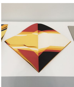
Raymundo Colares Gibi , 1970 Cut paper 13 7/16 x 13 7/16 inches (34.2 x 34.2 cm) C25881