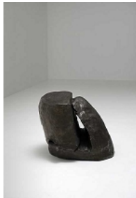
Paulo Monteiro Untitled, 2000 Bronze 28 11/16 x 35 3/8 x 35 3/8 inches (73 x 90 x 90 cm) C25885