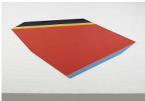
Kenneth Noland Adjoin , 1980 Acrylic on canvas 89 7/8 x 178 3/4 inches (228.3 x 454 cm)