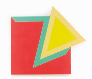
Frank Stella Moultonboro III , 1966 Alkyd and epoxy on shaped canvas 110 x 120 inches (279.4 x 304.8 cm)

531 West 24th Street New York NY 10011 tel 212 206 9100 fax 212 206 9055 www.luhringaugustine.com