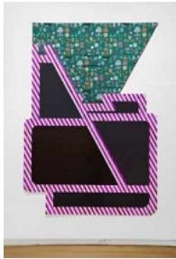
Ruth Root Untitled, 2015 Fabric, plexiglas, enamel paint and spray paint 105 3/4 x 72 inches (268.6 x 182.9 cm)