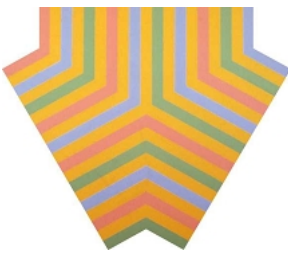
Jeremy Moon Joyride , 1967 Acrylic on canvas 104 7/8 x 122 inches (266.5 x 310 cm)