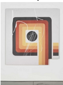
Jeff Elrod Untitled, 2015 Acrylic and UV ink on canvas 72 x 66 1/2 inches (182.9 x 168.9 cm)