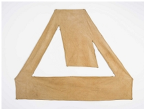
Richard Tuttle Red Brown Canvas , 1967 Stained fabric 53 1/2 x 68 inches (135.9 x 172.7 cm)