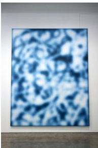
Untitled (blue blur) , 2016 UV ink on Fischer canvas 144 x 114.5 inches (365.7 x 290.8 cm)