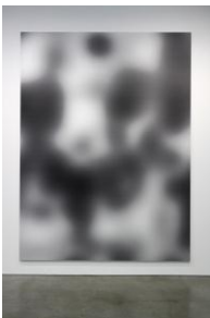
Figment IV , 2016 UV ink on Fischer canvas 144 x 108 inches (365.7 x 274.3 cm)