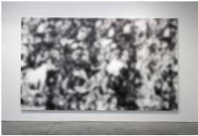
Plume , 2016 UV ink on Fischer canvas 114 x 194.5 inches (289.6 x 494 cm)