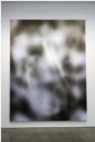
Untitled, 2016 UV ink on Fischer canvas 144 x 108 inches (365.7 x 274.3 cm)

25 Knickerbocker Avenue Brooklyn NY 11237 tel 718 386 2747 fax 718 386 2744 www.luhringaugustine.com