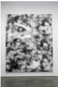
Untitled (blur) , 2016 UV ink on Fischer canvas 133 x 108 inches (337.8 x 274.3 cm)