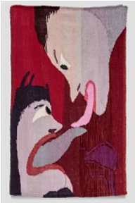
Tongues , 2018 Cotton and wool 58 x 35 inches (147.3 x 88.9 cm) C32573

531 West 24th Street New York NY 10011 tel 212 206 9100 fax 212 206 9055 www.luhringaugustine.com