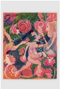
Woman on Pink Floral Background, 2018 Watercolor and gouache on paper 15 x 12 inches paper size (38.1 x 30.5 cm) C32553