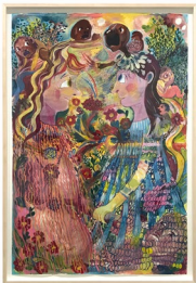
Two , 2019 Watercolor and gouache on paper 71 3/4 x 41 inches paper size (182.3 x 104.1 cm) C32558