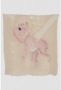
Baby , 2019 Cotton and ink 28 x 24 inches (71.1 x 61 cm) C32576