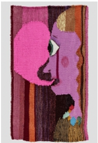
Pink Bubble, 2018 Cotton, wool and ink 34 1/2 x 19 1/2 inches (87.6 x 49.5 cm) C32571