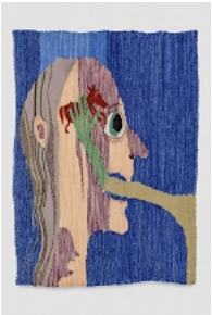
Horse, 2019 Cotton, wool, linen and ink 43 x 30 inches (109.2 x 76.2 cm) C32574