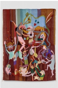
Untitled (brown background) , 2018 Cotton, wool, linen, silk and watercolor 123 x 88 inches (312.4 x 223.5 cm) C32570