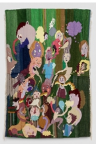
Untitled (green background) , 2018 Cotton, silk, linen and wool 119 x 80 inches (302.3 x 203.2 cm) C32572