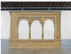
Pleasure pavilion A, Late 18th or early 19th c. Sandstone and brick 180 x 144 x 144 inches 457.2 x 365.76 x 365.76 cm