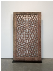
Large Jali with interlocking octagons and stars, Late 16th c. Sandstone 70 1/8 x 40 1/2 inches 178 x 103 cm