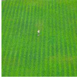
Untitled (kite), 2012