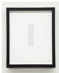
Untitled (verisimilitude) , 2012 Graphite on paper 15 5/16 x 12 7/16 inches (38.89 x 31.59 cm)