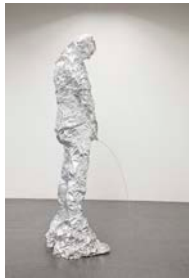
Untitled (peeing figure) , 2012 Stainless steel Edition 1 of 3 From an edition of 3 and 2 artist's proofs Figure: 96 x 30 x 27 inches (243.84 x 76.2 x 68.58 cm) Urine stream: 56 x 10 x 1/2 inches (142.24 x 25.4 x 1.27 cm)