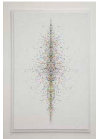
Untitled (bscsb), 2012 Styrofoam, paint and paper on board 60 1/4 x 39 1/2 inches (153.04 x 100.33 cm)