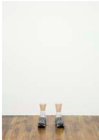
Untitled (nobody), 2012 Styrofoam and paint 13 x 16 1/2 x 11 1/2 inches (33.02 x 41.91 x 29.21 cm)