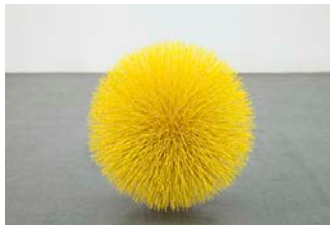
Untitled (sun), 2012