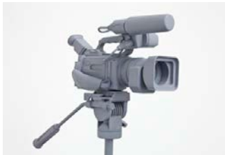
Untitled (video camera), 2012