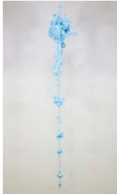
Untitled (blue space station) , 2012 Styrofoam and paint 106 x 20 inches (269.24 x 50.8 cm)