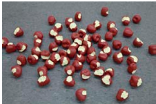
Untitled (apples) , 2012 Styrofoam and paint Diameter: 68 inches (172.72 cm)