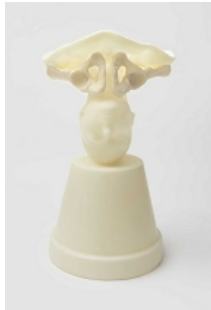
to channel , 2015 Polyurethane resin Edition of 3 and 1 artist's proof 27 x 15 x 15 inches (68.6 x 38.1 x 38.1 cm)