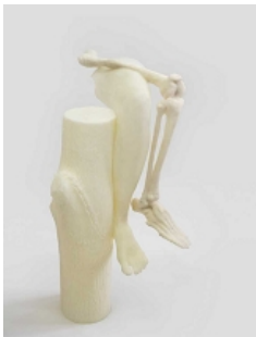
to compose , 2015 Polyurethane resin Edition of 3 and 1 artist's proof 35 x 20 x 24 inches (88.9 x 50.8 x 61 cm)