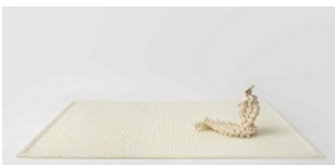
to twine , 2015 Polyurethane resin Edition of 3 and 1 artist's proof 18 x 48 1/2 x 72 inches (45.7 x 123.2 x 182.9 cm)