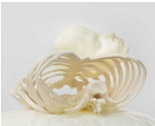
to long , 2015 Polyurethane resin Edition of 3 and 1 artist's proof 67 x 26 x 21 inches (170.2 x 66 x 53.3 cm)