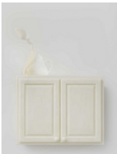
to quench , 2015 Polyurethane resin Edition of 3 and 1 artist's proof 43 x 30 1/2 x 14 1/2 inches (109.2 x 77.5 x 36.8 cm)