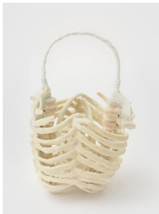
to coalesce , 2015 Polyurethane Resin Edition of 3 and 1 artist's proof 22 1/2 x 14 1/2 x 10 inches (57.1 x 36.8 x 25.4 cm)