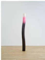
Mark Handforth Half-Sleep City , 2023 Aluminum and polyurethane paint 102 x 12 x 12 inches (259.1 x 30.5 x 30.5 cm)