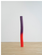
Mark Handforth Form-Constant Orange , 2023 Aluminum and polyurethane paint 92 x 12 x 12 inches (233.7 x 30.5 x 30.5 cm)