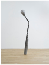
Mark Handforth Ash , 2023 Cast Aluminum 114 x 22 x 12 inches (289.6 x 55.9 x 30.5 cm) Edition of 3 plus 1 artist's proof

531 West 24th Street New York NY 10011 tel 212 206 9100 fax 212 206 9055 www.luhringaugustine.com