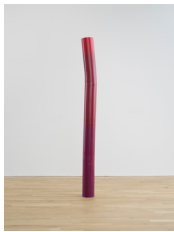
Mark Handforth Dark Light , 2023 Aluminum and polyurethane paint 112 x 12 x 12 inches (284.5 x 30.5 x 30.5 cm)