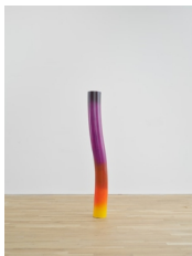
Mark Handforth Yellow Violet Sky , 2023 Aluminum and polyurethane paint 81 x 12 x 12 inches (205.7 x 30.5 x 30.5 cm)