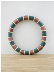
Mark Handforth Serpent Belt , 2023 Stainless steel, bronze, copper coating, and polyurethane paint 36 x 96 x 96 inches (91.4 x 243.8 x 243.8 cm)