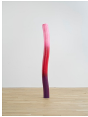
Mark Handforth Hypnagogic Candy , 2023 Aluminum and polyurethane paint 103 x 12 x 12 inches (261.6 x 30.5 x 30.5 cm)

531 West 24th Street New York NY 10011 tel 212 206 9100 fax 212 206 9055 www.luhringaugustine.com