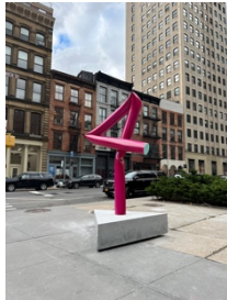
Mark Handforth Franklin Street Four , 2023 Painted aluminum 120 x 70 x 22 inches (304.8 x 177.8 x 55.9 cm)