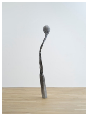
Mark Handforth Bela Lugosi , 2023 Cast Aluminum 109 x 24 x 12 inches (276.9 x 61 x 30.5 cm) Edition of 3 plus 1 artist's proof