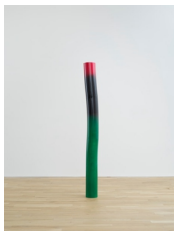
Mark Handforth Lucid Green (dream) , 2023 Aluminum and polyurethane paint 95 x 12 x 12 inches (241.3 x 30.5 x 30.5 cm)